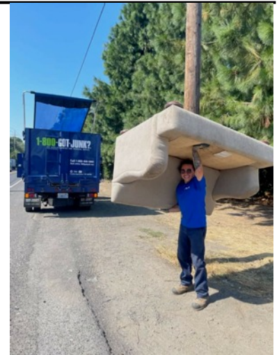
1-800-GOT-JUNK picking up an abandoned couch at NE Sandy Blvd & NE 161st

Leaves left in the street create slip hazards, flooding, clogged drains and can block traffic. If fall leaves are blocking a storm drain in your neighborhood, please rake them aside or bag them up.