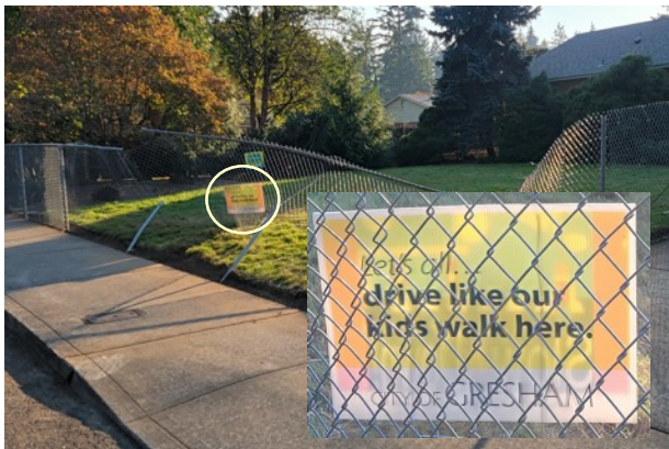
Aftermath of a 3-car injury accident Sunday Oct 2, 2022, 835 NE 172nd Ave. The sign behind the fence reads: "let's all...drive like our kids walk here"

Debris, car parts, and glass was everywhere. There could have been fatalities, and worse injuries and damages.