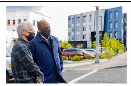
Congressman Blumenaur and Gresham Mayor Stovall tour Downtown Rockwood in 2021

In 2003, Gresham voters approved the establishment of the Rockwood-West Gresham Urban Renewal Area authorizing the