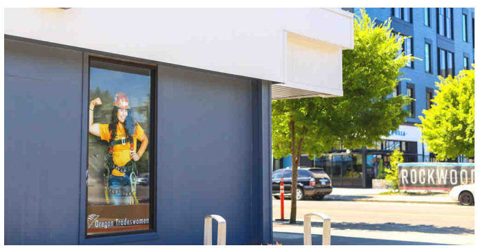
Oregon Tradeswomen building completed 2020.

Diverse vendors of all cultures will be showcasing their goods during this market. Visit peoplesmarketrockwood.org for more information. A formal grand opening will follow in early May. The Market Hall is already 80% occupied with tenants. Space remains available for market grocers, a coffee shop and office tenants.