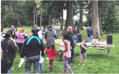
News from North Gresham Neighborhood

With the help of many neighborhood, government, business and community members, Kirk Park in North Gresham is very close to the point where it will finally have a playground.