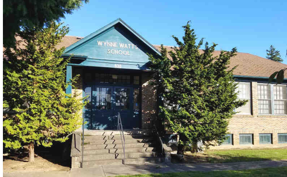
Albertina Kerr Wynne Watts School, 930 NE 162nd Av, Gresham

We have seen in recent years more employees leaving their work as DSPs for less physically and emotionally taxing positions with better pay, now available in an improving economy. In fact, the organization's vacancy and turnover rates for DSPs have grown significantly in the last five years. These factors strain Kerr's ability to provide the stable social safety net