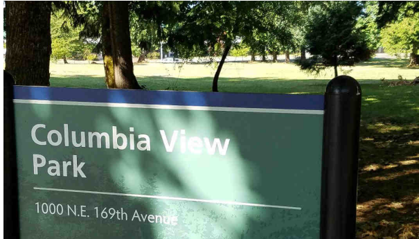
Columbia View Park (South of H B Lee Middle School, NE 172nd)