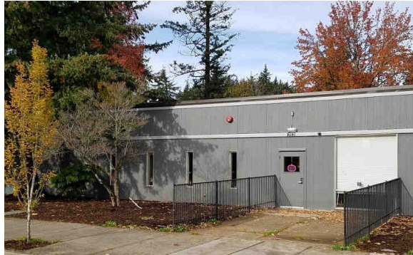
Gresham Women's Shelter, 162nd & E Burnside, Gresham OR

Approximately 18 months ago we had the opportunity to meet with a number of community partners and discuss the challenges faced by women who are experiencing homelessness. From that meeting, a vision was generated that has now led to the opening of the Gresham Women's Shelter. This shelter is domestic violence informed and designed to help alleviate the pressure points in the domestic violence system while providing around the clock access to crisis beds. The facility and programming were significantly influenced by a County lead pilot project exploring the use of Human Centered Design and the principles of Trauma Informed Care. The investment supporting the opening was due in large part to the leadership of A Home for