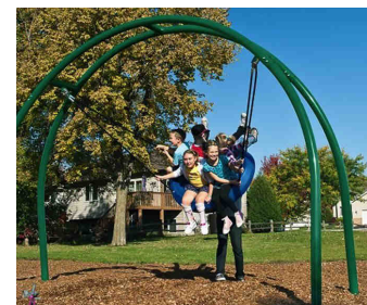
ADA accessible Oodle Swing

Be sure to come see the new additions at the park including a multilingual bird interpretative sign, new ADA accessible Oodle Swing (right, in progress), and new park ambassadors!