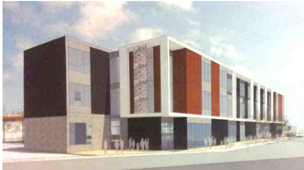
Sunrise Rockwood Charter School, SE Stark & E Burnside. Completion in 2015

Starting in April, demolition will begin to make way for construction of a new three-story, 53,000 square foot building for the Sunrise Rockwood Charter School at 19034 SE Stark Street in West Gresham.