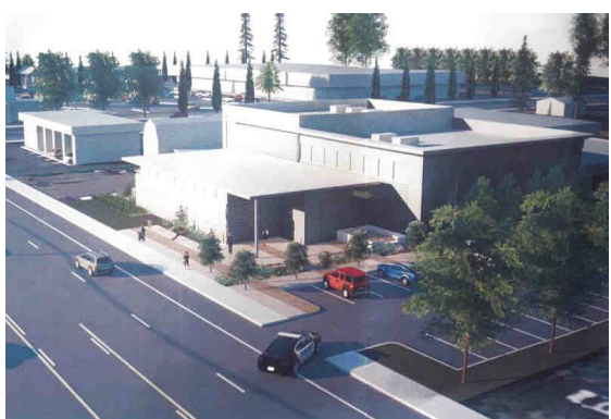
Artist's concept, new Rockwood Public Safety Facility, 675 NE 181st

Considered an essential facility, the new building is required to be 20% stronger than a typical commercial facility.