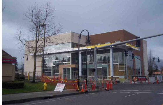
East County Courts Building, 185th & SE Stark St. Opening April 2012

The new courthouse is only for civil matters.