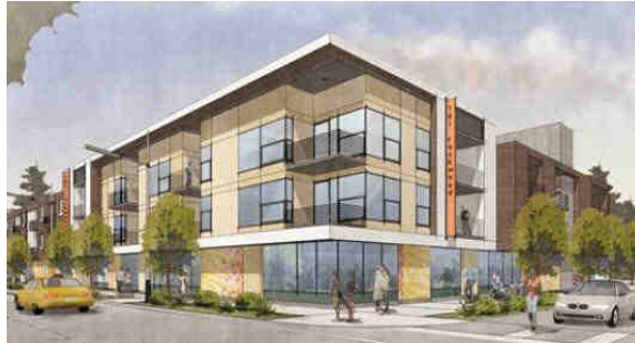
The Rockwood Building, Multi Service Center, NE 181st & Couch

For years the grassy vacant lot on NE 181st Ave near Burnside served only an occasional traveling carnival or Christmas tree vendor. Now, that lot is being transformed into a Multi-Service Center to serve area families in need.