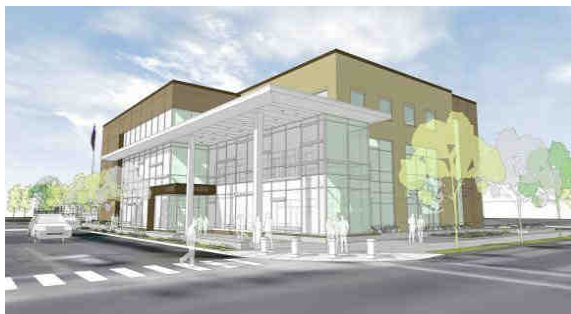
East County Courts revised design, Rockwood 185th & SE Stark

After more than 40 years the East County Courts will be built in Rockwood. Ground breaking on the new court facility will begin before year's end.