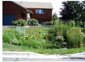
Rain gardens protect area streams

Planning new landscape? Add a rain garden.