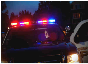
Gresham Police Department

Gresham Police offer new online reporting of nonemergency crimes.