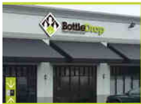
Bottle Drop Center, Wood Village

Cha-Ching! Wood Village Redemption Center includes EZ Drop for greater convenience.