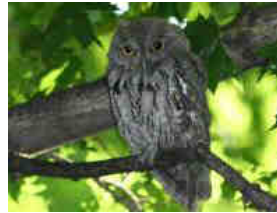
Western Screech Owl