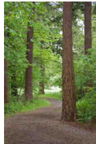
Nadaka Nature Park