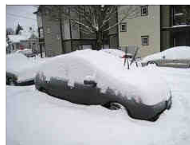
December 23, 2008 Portland OR

A recent story in the Portland Tribune said Portland area residents are in for a wet and wild winter according to a series of forecasts presented by members of the Oregon chapter American Meteorological Society.