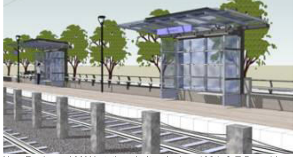
New Rockwood MAX station shelter design, 188th & E Burnside

Infrastructure improvement projects have already started in some Central Rockwood areas with all projects expected to be underway by June 1.