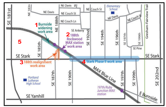
Rockwood in Motion Construction Area Map